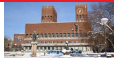
2 Oslo City Hall Built from 1931 to 1950