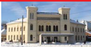
1 Nobel Peace Center 2005 Railway station 1877