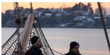
11 Bleikøya, Lindøya and Nakholmen Islands with 572 small cottages