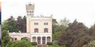
14 Oscarshall 1852 Royal Summer Castle