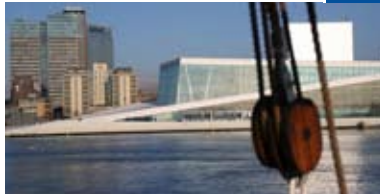
7 The Opera House Built 2008. Architects: Snøhetta

Founded year 950. Best seen from the fjord with the green hills surrounding the city and with the endless woods and mountains behind. 600 000 inhabitants