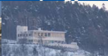
8 Ekeberg Restaurant Built 1927