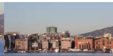
16 Aker Brygge, Shipyard 1854 Shopping and restaurants 1985