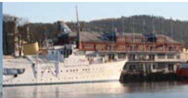
4 Harbour Office 1915/1987 and Royal Yacht 1937/1948