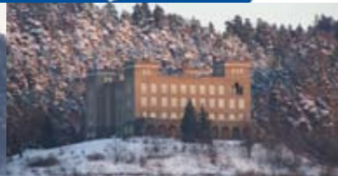
9 Former Maritime School Built 1917