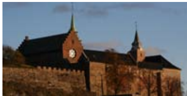
3 Akershus Fortress Medieval castle built 1299, renaissance 1730