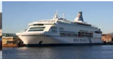
5 Ferries to Denmark. Daily to Copenhagen and Fredrikshavn