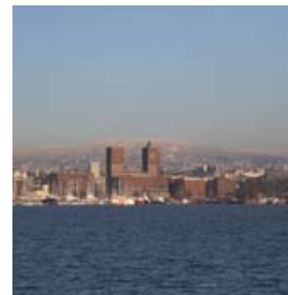
12 OSLO, capital of Norway

Founded year 950. Best seen from the fjord with the green hills surrounding the city and with the endless woods and mountains behind. 600 000 inhabitants