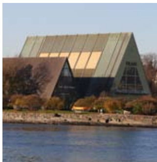
13 BYGDØY Museum Island Houses built