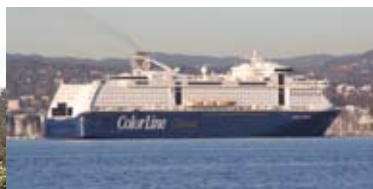
15 Ferries to Germany Daily to Kiel