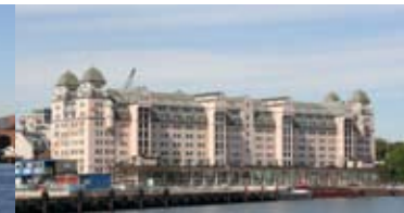
6 Harbour storage center 1916. First concrete bld. in Norway. Today offices