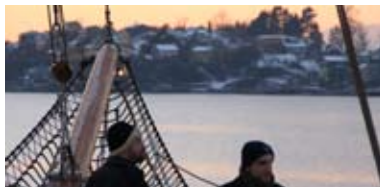
11 Bleikøya, Lindøya and Nakholmen Islands with 572 small cottages