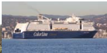
15 Ferries to Germany Daily to Kiel